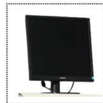
Philips 19 inch monitor