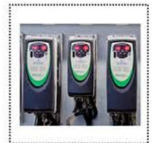
Automatic inverters Brand: Emerson in USA