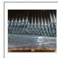
Roller Brand: NTN(Japan)