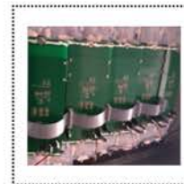
Detection board Brand: DT (Finland)