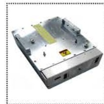
X-Ray generator(150KV) Brand: KV Tech