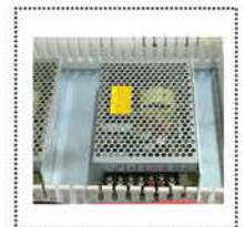
Power Supply Brand: Mingwei(Taiwan)