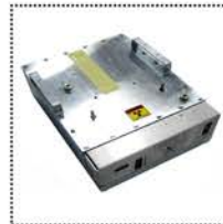
X-Ray generator(150KV) Brand: KV Tech