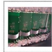
Detection board Brand: DT (Finland)