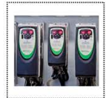
Automatic inverters Brand: Emerson in USA