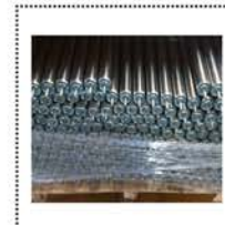
Roller Brand: NTN(Japan)