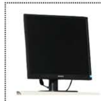
19 inch *2 Monitor Brand: Philips